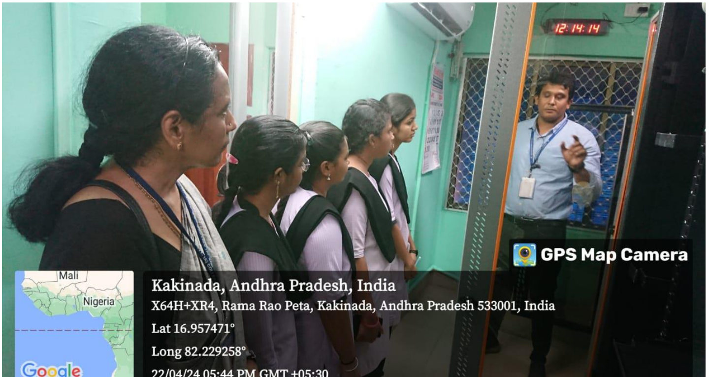
Students observing the Air traffic controlling process